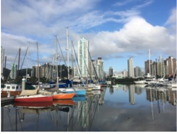
marinaitajai restaurant and office photo Virginia Spencer