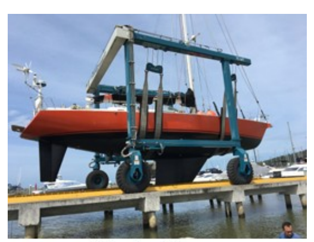
75 ton travel lift